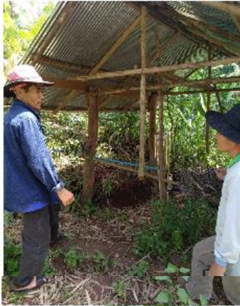
Below: Some of the water storage and filtration systems we were able to study. Clean Water!