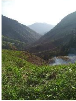
Above: Overview of the progress of the coffee projects at the Center for Sustainable Development.