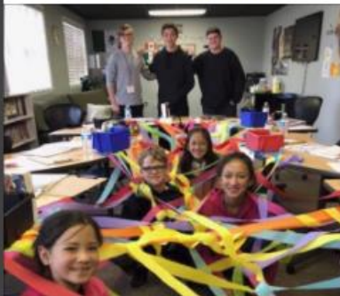
Below: Teen Debrief