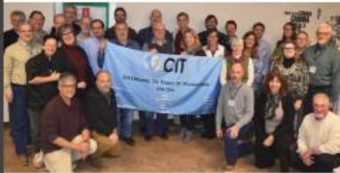
Above: Partnership Meeting