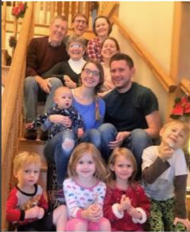
Above: Ekstands and family